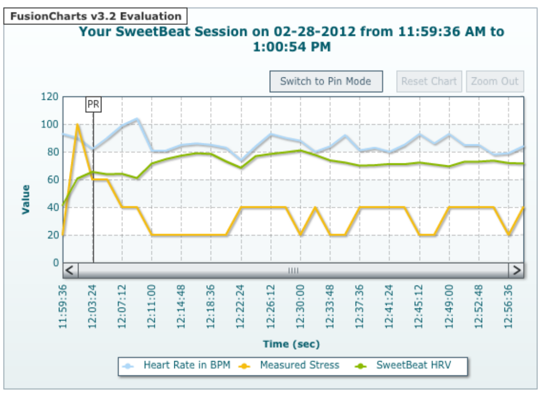
Figure 4. Patient A's Qi-Gong Session

Figure 4 is a session from Patient A's Qi-Gong class. Referring to Figure 4, you can see the HRV value (green line) shoot up in the beginning when the class starts. When the class gets going, the HRV stays relatively stable, which means that Patient A's parasympathetic branch was reasonably stable. The measured stress (orange line) goes down dramatically in the beginning and stays fairly low the entire session.