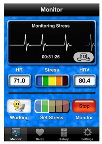
Figure 2: MySweetBeat App Description